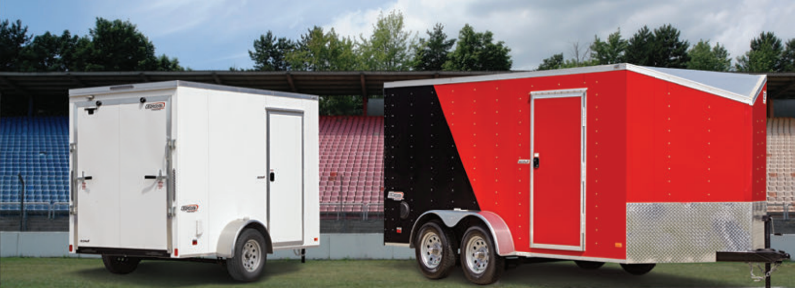
6 x 10