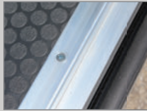
HEAVY-DUTY FLOOR TRIM