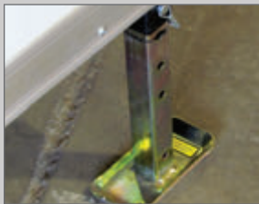
DROP DOWN JACKS