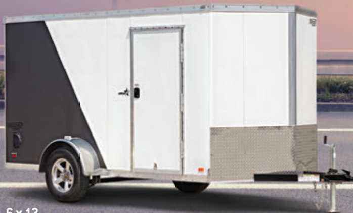
6 x 12