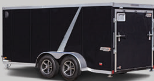
7 x 14 LoRider