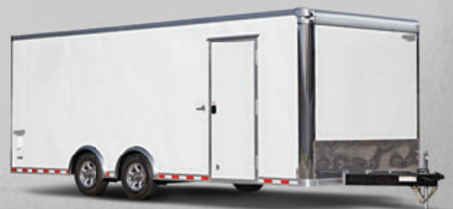
8.5 x 22 WITH SPREAD AXLES