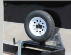
SPARE TIRE OPTIONS IN A VARIETY OF POSITIONS