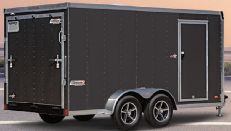
7 x 16