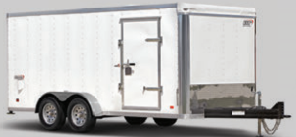
7 X 14 WITH OPTIONAL ADJUSTABLE PINTLE EYE HITCH