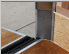
GALVANIZED STEEL PLATE PROTECTS CORNER POST

LET BRAVO BUILD YOUR TRUE COMMERCIAL QUALITY LANDSCAPE TRAILER!