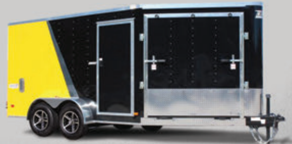
7X14 WITH TERRAIN PACKAGE, TWO-TONE EXTERIOR WITH ANODIZED STRIP AND BLACK ALUMINUM BLADE WHEELS