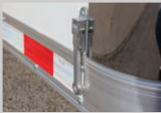
CAST ALUMINUM DOOR HOLD BACKS