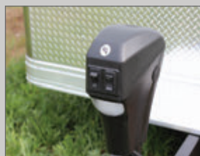
12V POWER NOSE JACK