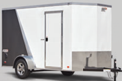
6X12 WITH TWO-TONE EXTERIOR WITH ANODIZED STRIP AND SILVER ALUMINUM BLADE WHEELS

THERE IS A BRAVO TRAILER TO MEET EVERY NEED, BOTH RECREATIONAL AND COMMERCIAL. OUR UNBEATABLE COMBINATION OF GREAT LOOKS, BUILD QUALITY AND OPTIONS IS UNSURPASSED IN THE INDUSTRY. AND BRAVO'S COMMITMENT TO YOUR TOTAL SATISFACTION AFTER THE SALE IS LEGENDARY. BRAVO TRAILERS WILL LAST LONGER, WORK BETTER AND BE WORTH MORE AT TRADE IN TIME. THAT'S THE BRAVO WAY.