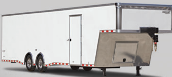
8.5 x 38 WITH SPREAD AXLES, SUPERSTAR PACKAGE AND 6' RISER