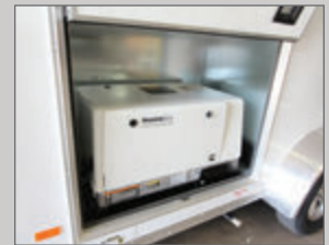
GENERATOR AND ELECTRICAL OPTIONS