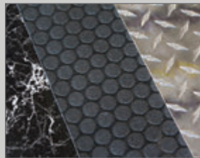
BLACK MARBLE, BLACK COIN, ATP FLOORING