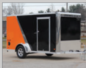
SPLIT COLOR WITH BRIGHT FINISH STRIP

GO TO BRAVOTRAILERS.COM FOR HUNDREDS OF OPTIONS AND ADDITIONAL PICTURES