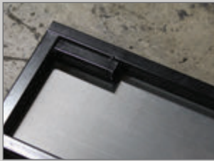
STEEL FRAMED REAR DOUBLE DOORS

STAR TRAILERS BY BRAVO ARE GREAT LOOKING, PREMIUM COMMERCIAL-QUALITY TRAILERS AT A MID-RANGE PRICE. STAR'S COMBINATION OF STANDARD FEATURES AND AVAILABLE PACKAGES MAKE IT THE BEST VALUE IN THE INDUSTRY. THEY ARE AVAILABLE IN 6', 7' AND 8.5' WIDTHS, TAGS AND GOOSENECKS WITH LENGTHS TO 48'. YOU DESERVE SOMETHING SPECIAL!