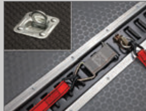
TIE DOWN OPTIONS