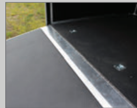
ALUMINUM TRANSITION FLAP